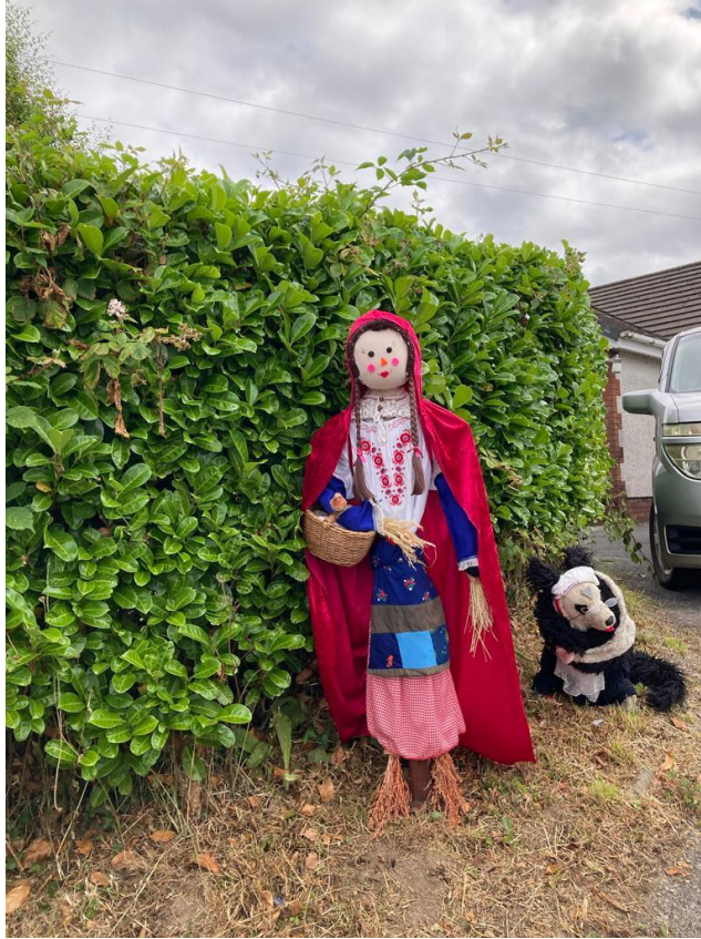
2 il / 2 nd Keamore, Pentrepoeth