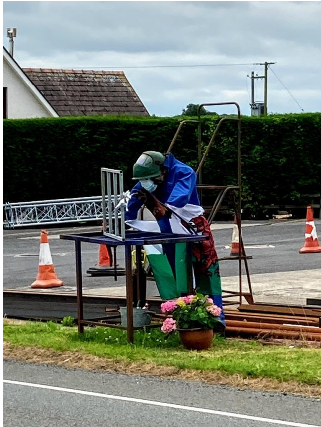
3 ydd / 3 rd Star Forge, Upland Arms