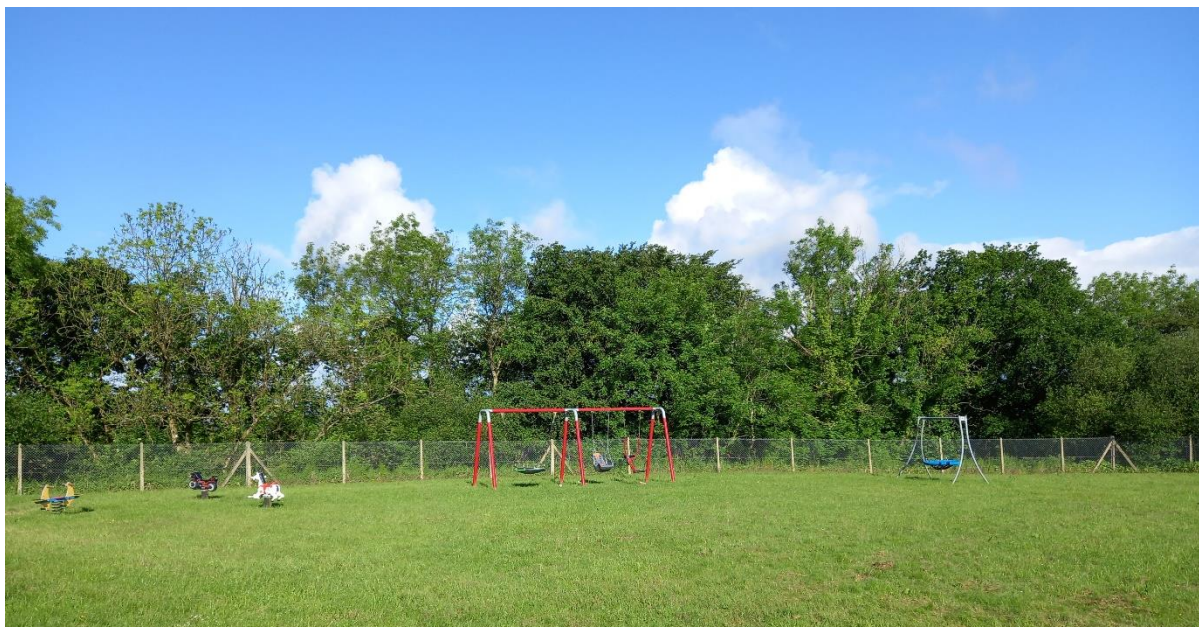
Cae Idole Field