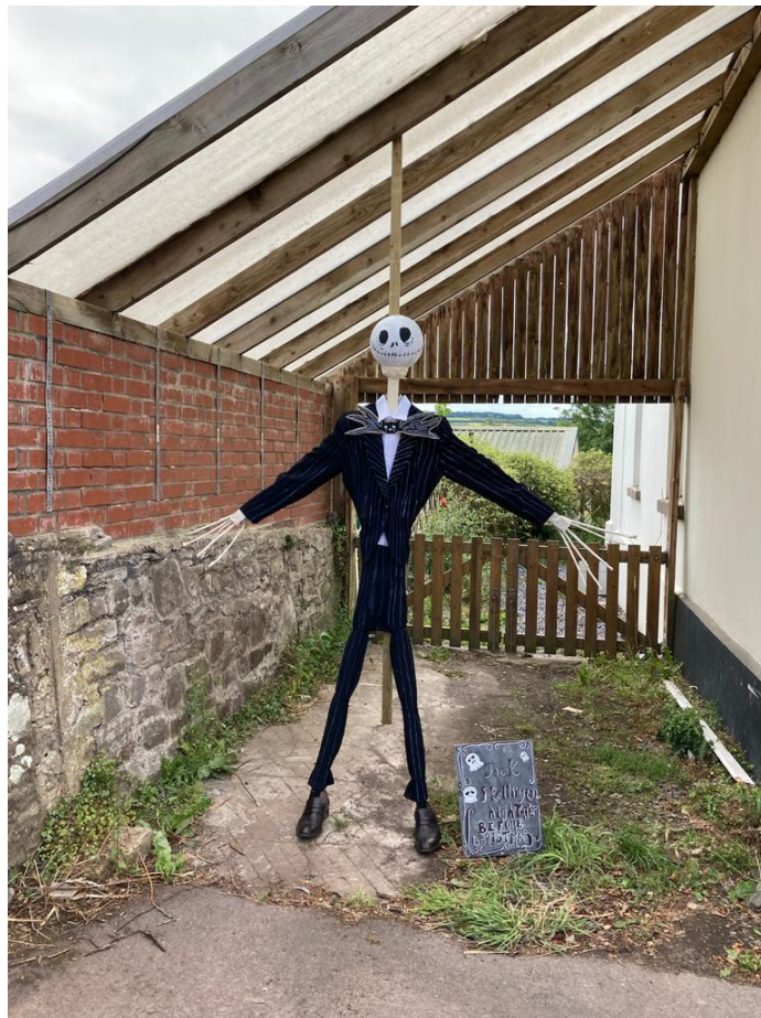
3 ydd / 3 rd Preswylfa, Llandyfaelog