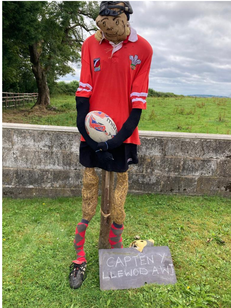
1 af Fferm y Capel, Bancycapel / 1 st Capel Farm, Bancycapel