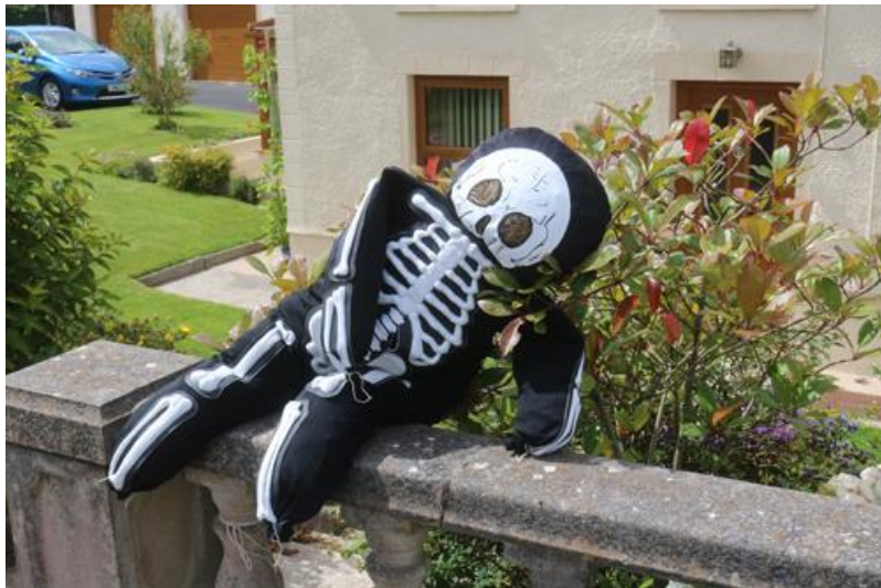
Beili Glas, Upland Arms