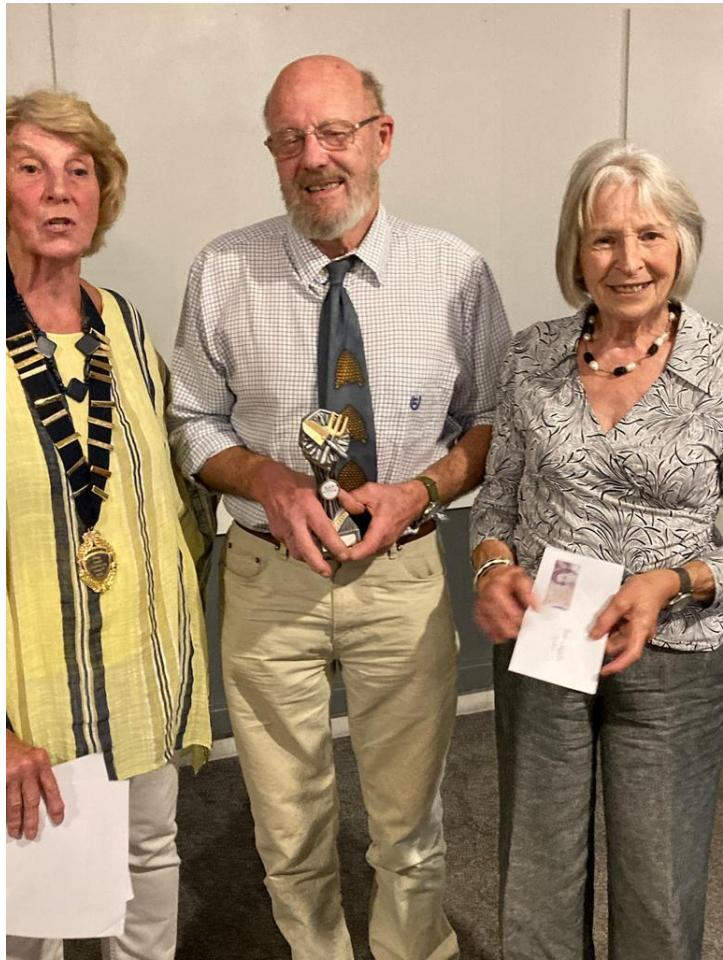
Best Vegetable Garden – Cwmburry Honey Farm