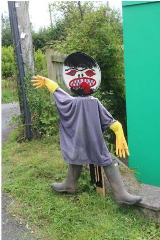
Nant yr Arian, Pentrepoeth