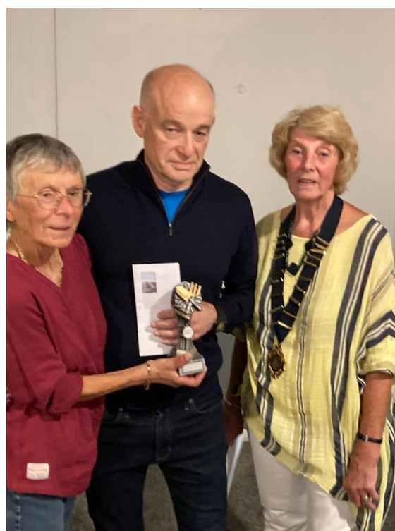
Carreg Wen, Llandyfaelog