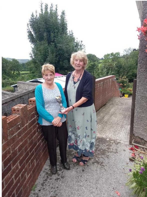
Best Small Flower Garden, 3 Bro Pedr, Llandyfaelog