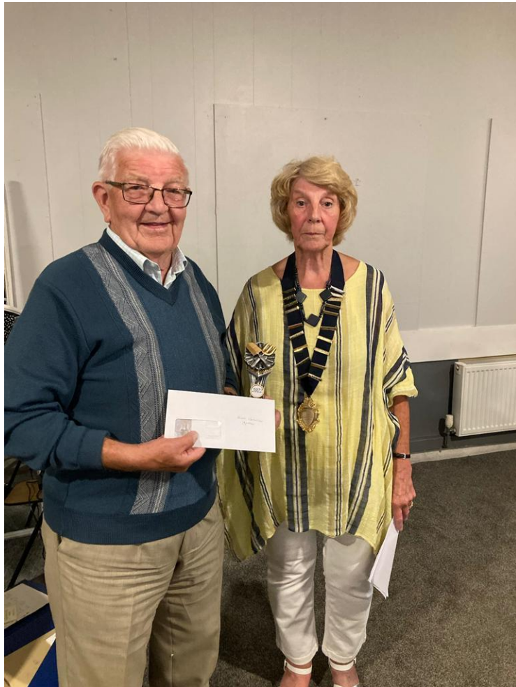
Best Container Garden 2022 – Llygaid yr Efail, Upland Arms