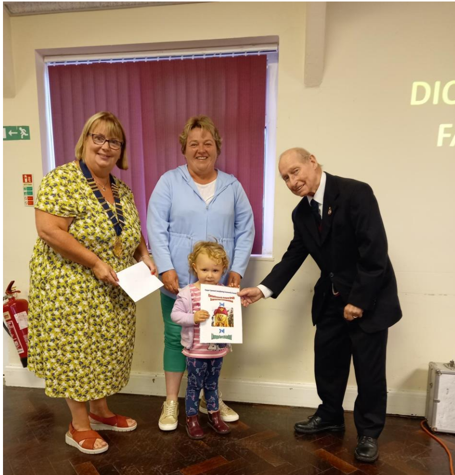
Ger y Llan