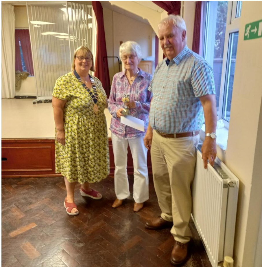
14 St Anne's