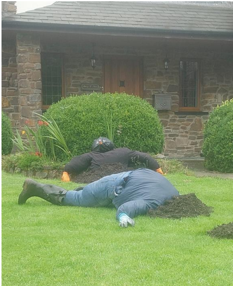
Brig y Nos