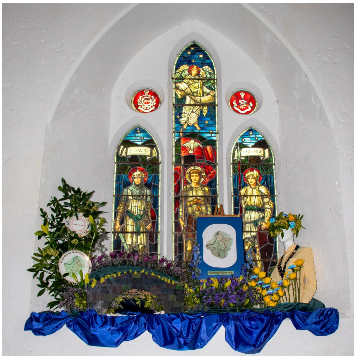
Arddangosfa Cyngor Cymuned Llandyfaelog Community Council Display

St Maelog's Church in Llandyfaelog held an Easter Flower Festival on 1 st April. Congratulations to all the Volunteers and Community Organisations that provided for a wonderful exhibition.